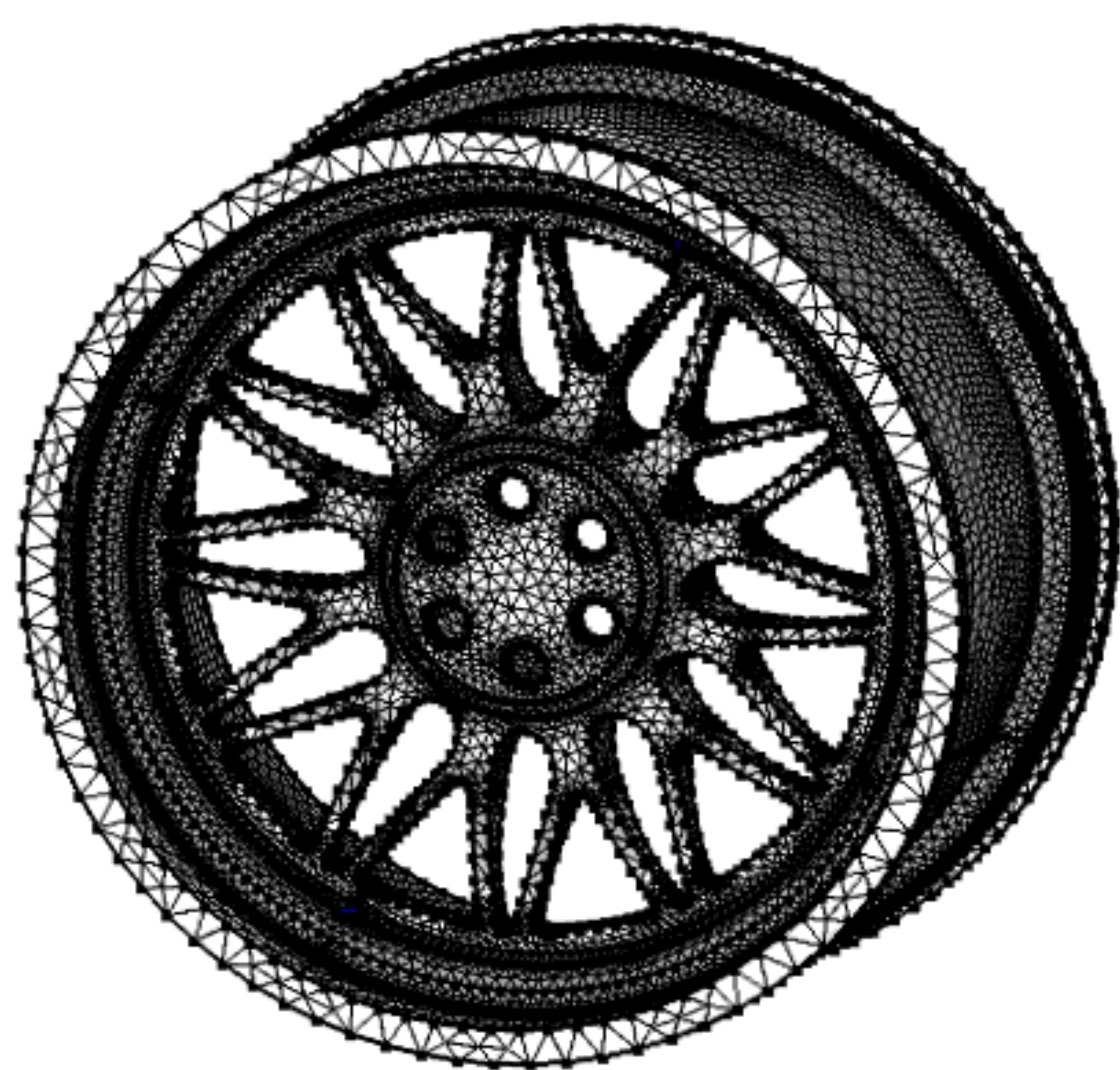
Fig 1. CAD Model of Casted Aluminium Alloy Wheel

Introduction: In Casting Process Liquid Material is usually Poured Into a Mould of desired Shape and then allowed to Solidify. Casting product performance dependence on Material, Flow, Process Temperature, Solidification, Shrinkage and Residual Stress. In a casting process not all available resources are utilized effectively which results in low quality of casting, defects and Metal wastage. Physics based Modelling is increasingly used to optimise product performance, improve quality and reduce defects of casting products. In this poster phase change solidification process of alloy wheel is investigated for process performance and optimisation.